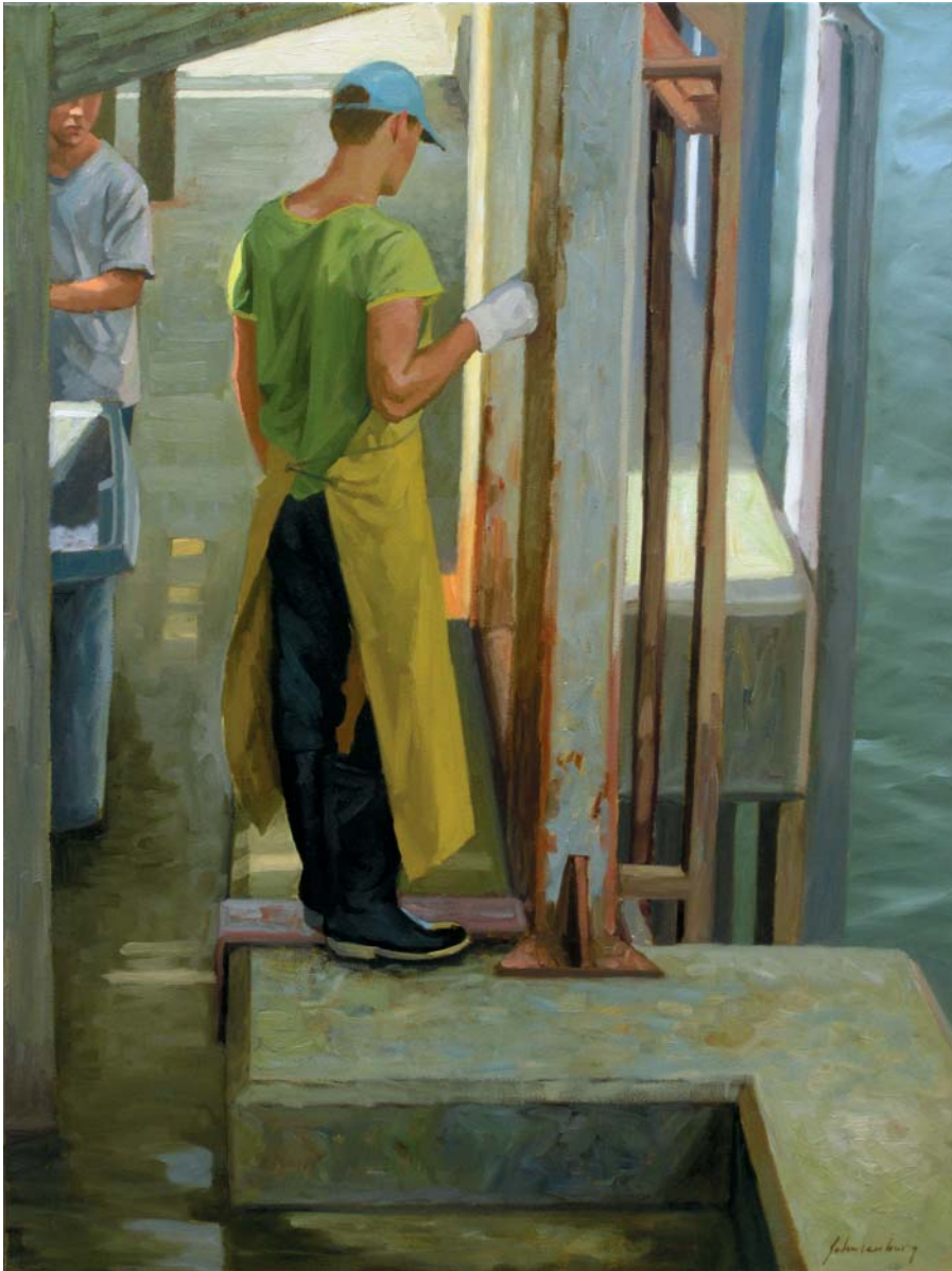
WORKING AT THE PIER, OIL ON CANVAS, 40 X 30"