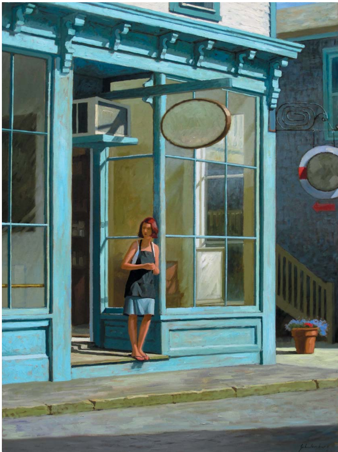
AN EYE ON COMMERCIAL STREET, OIL ON CANVAS, 48 x 36"

"I am influenced by Edward Hopper and this building had a nice quality reminiscent of the kind of architecture he would paint," the artist says. "I studied the storefront for quite awhile and noticed the shop girl would occasionally come out and watch the people going up and down the street. I liked her gesture while she was leaning in the doorway—relaxed but ready for the next customer."